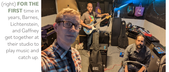
(right) FOR THE FIRST time in years, Barnes, Lichtenstein, and Gaffney get together at their studio to play music and catch up.

For Barnes, the process of accepting and loving your creation as it ages is just as important as the actual creation.