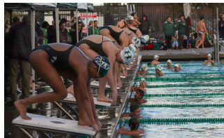
GETTING READY FOR a 50 yard race, the girls get in their stance, waiting for the signal to go.