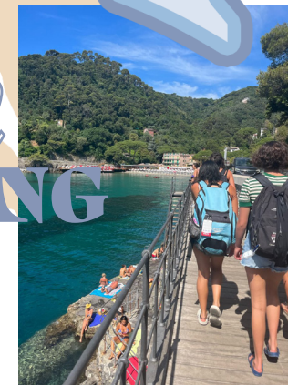
an Italian club team at a local pool.

After the practices the day included five miles hikes through towns around Camogli and playing against